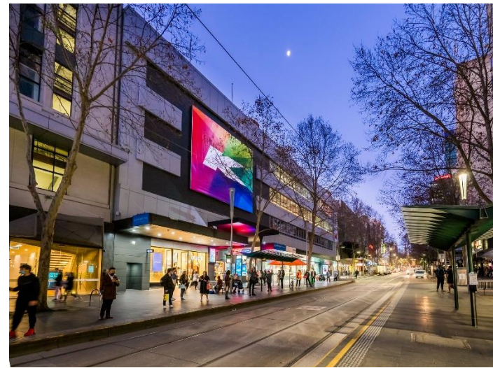
Melbourne Campus Level 2, 222 Bourke St Melbourne VIC 3000