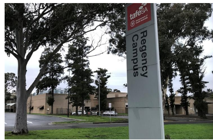
Adelaide Campus 137 Days Road Regency Park Adelaide, SA 5010